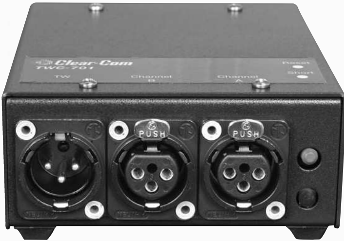
TWC-701 Front panel